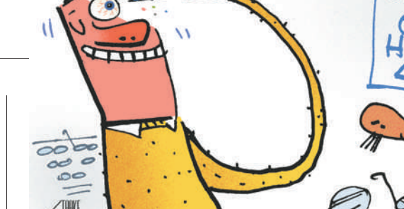
BOB STAAKE FOR THE WASHINGTON POST

Still running – deadline Monday night – is our "framed couplets" light-verse contest. See wapo.st/inv978.